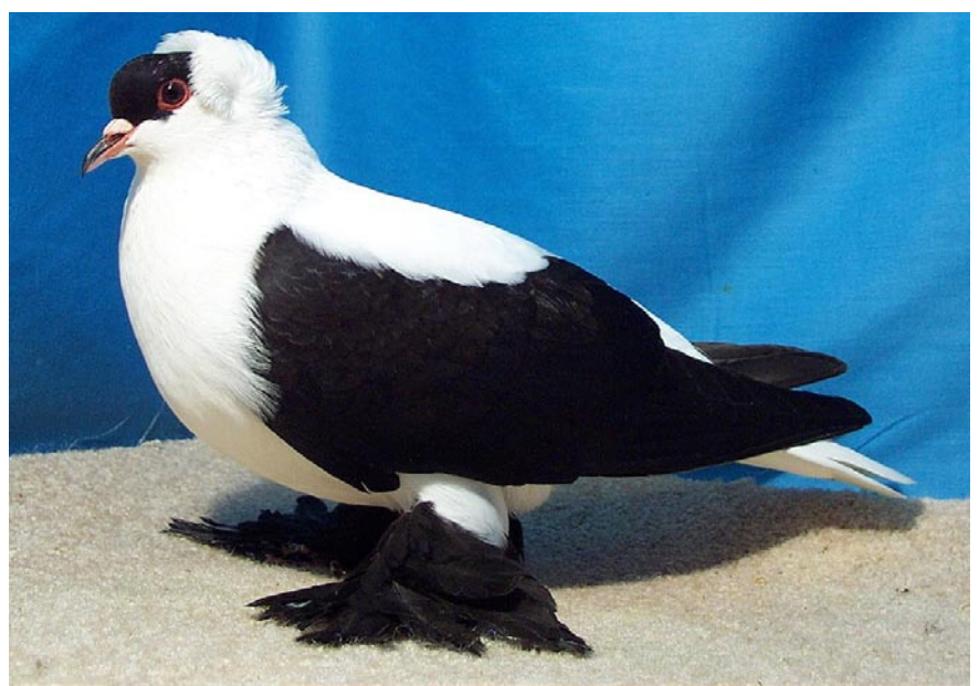
Black Nurenberg Swallow