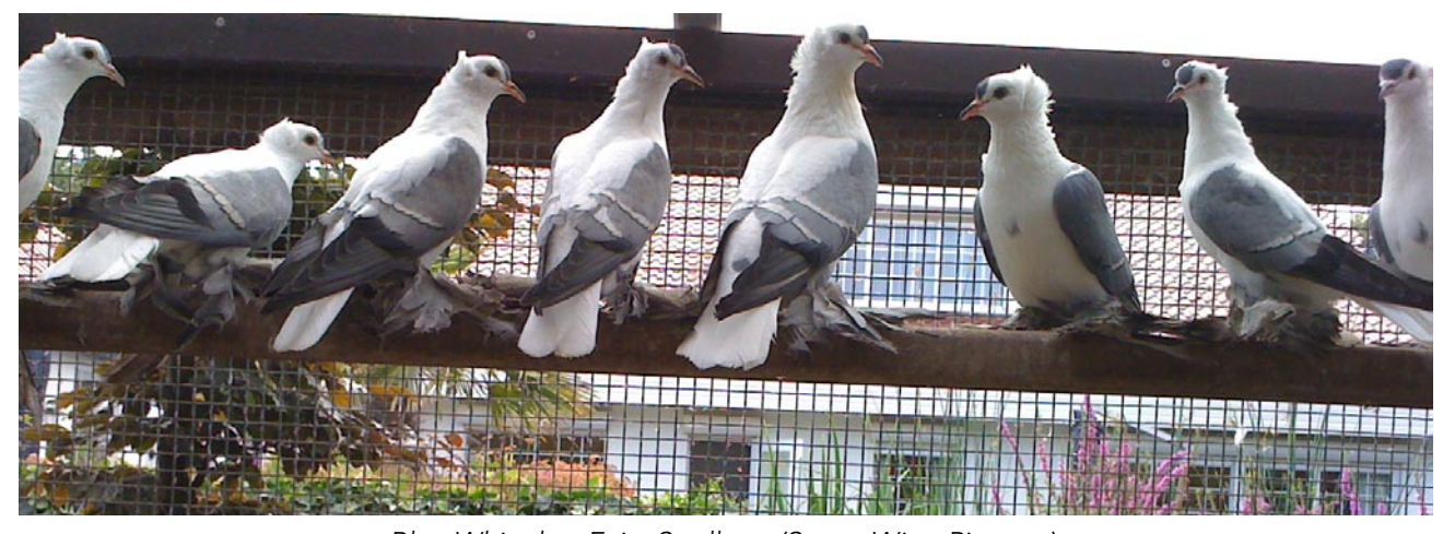
Blue White bar Fairy Swallows (Saxon Wing Pigeons)