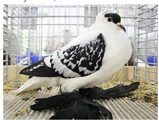
Saxon Swallow, Black Spangled sq 95Z Günter Gottwald

Gary, I just found it fascinating that today we have a requirement of finch marks having to be on the Black Spangled Swallow but not on the Red, Yellow, Blue or Dun. I wish you well, Frank.