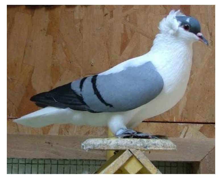
NOTE THE STATIONING ON THIS BIRD AND THE PURE-NESS OF THE BLUE - "YOUNG HEN" – bar length, bar separation and consistent bar width from the top to bottom – very clean.

NOTE THE CREST HEIGHT & FULL MANE – CLEAN FULL-HEAD PLATE CUT ALL THE WAY BACK WITH STRONG PUSH BACK FEATHERING – THIS ONE IS A "YOUNG HEN" – I know the heart is short and the bars taper too much etc. But this bird's crest is an example of what my vision was in 2005 – "if I could only introduce the extreme high quality features found in the Thüringer Wing Pigeon genes" – here you're seeing my vision became reality with drilled in full curl rosettes! It is this breeder's opinion that the Thüringer standard characteristics are offering a presentation of true elegance.