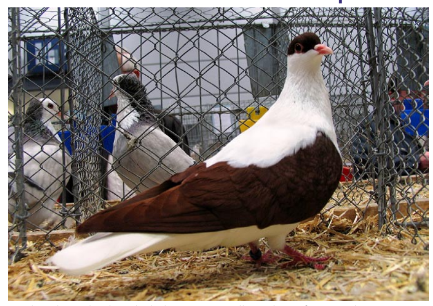
Red Barless Plainheaded Thuringer Swallow