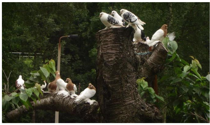
Color Pigeons in the Garden of Steffen Grund of Saxony, Germany