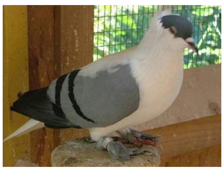
NOTE THE EGG SHAPED HEAD & POWER THIS "YOUNG COCK" SHOWS – NICE STATIONING – A FULLHEAD PLATE CUT NICE AND CLEAN– THE WHITENESS OF THE WADDLE AND THE FULL BLUE UPPER BEAK COLOR –THE BAR SEPARATION IS ALSO VERY NICE – TIGHT FEATHERD AND A VERY LARGE & FULL BODIED BIRD.